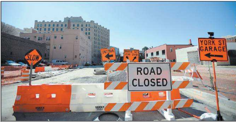
A tangle of detour signs on Duke Street can leave drivers paralyzed: Which way do you turn? How far will you get before you hit another roadblock? Will this mess pay off for Norfolk soon?