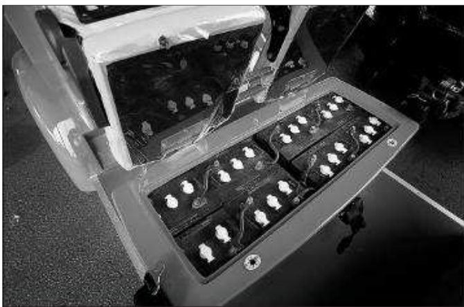
To use FRED to move around downtown Norfolk, just call (757) 478-7233.