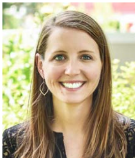
Members of the Downtown 100,

Thank you for another great year and for a very rewarding two years as Chair of our organization. I've been a member of the Downtown 100 now seven years. It has been my privilege to contribute to the renewal of this great city, in ways that probably wouldn't be possible in other places. Together, with so many other members and friends, I've painted sidewalks and grown gardens, brought life back to old buildings and helped bridge the gap between Norfolk and our neighbors. These experiences have given back to me more than I could have imagined when I first joined. In