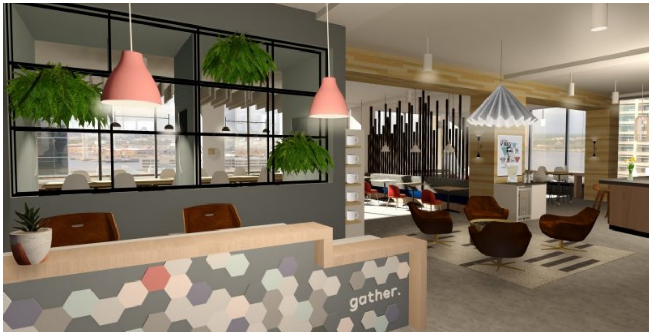
There will be a reception area for members and guests to check in at.

Town Center Cold Pressed is its coffee partner and Gather will work with local restaurants such as The Stockpot for future catered events.