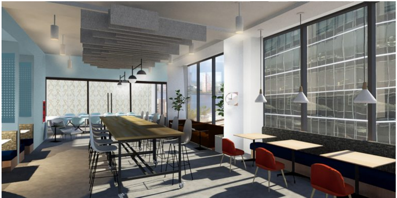
This mock-up of the co-working space shows how people can work in an open space and network with those around them.