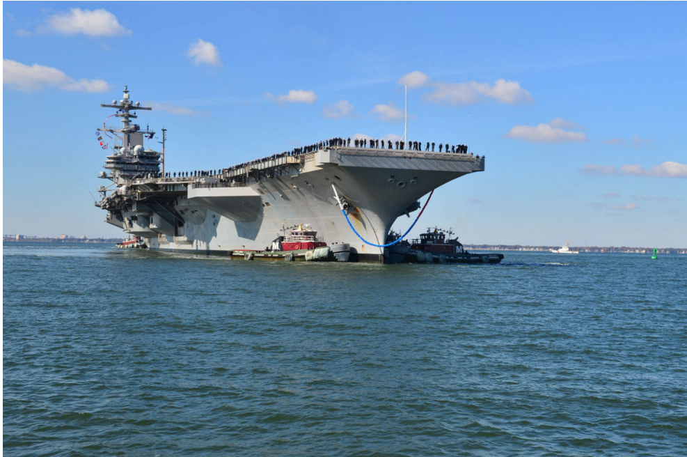
The aircraft carrier George H.W. Bush returns to Norfolk Naval Station on Nov. 15, 2014.

A thick fog settles over the water at Naval Station Norfolk, as a tugboat maneuvers it way next to the USS George H.W. Bush, right, to assist with its departure, Jan. 21, 2017, for a regularly-scheduled deployment.