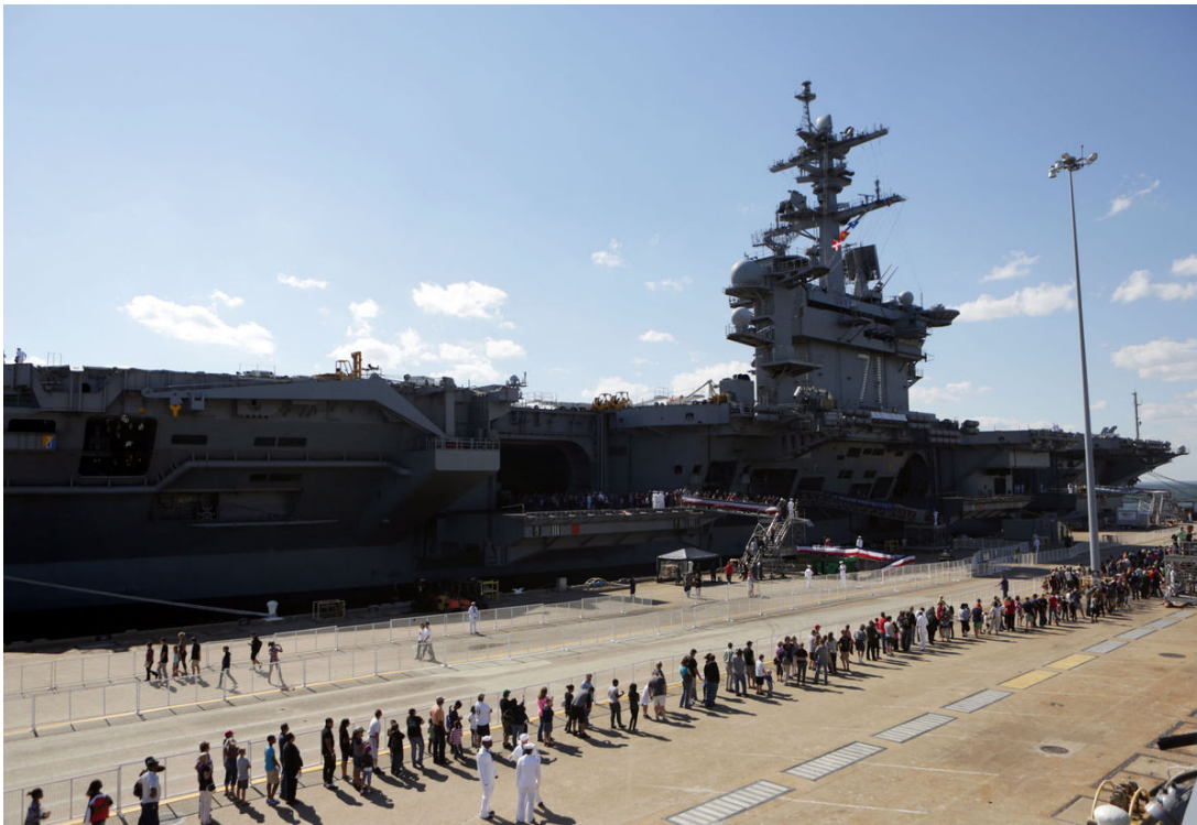
A long line of visitors queue up to tour several Naval ships, including the aircraft carrier Theodore Roosevelt, during Fleet Fest on Saturday, October 18, 2014, held at Norfolk Naval Station in Norfolk, VA. In celebration of Fleet Week Hampton Roads and the Navy's 239th birthday, Fleet Fest was open to public and included ship tours, a car show, military displays, and a chili cook-off.