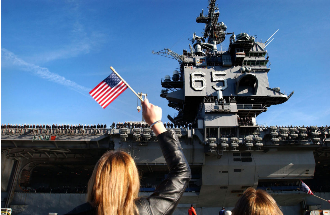
The carrier Enterprise pulls up to the pier at Norfolk Naval Station, Sunday, February 29, 2004, after a six-month deployment in the Persian Gulf.