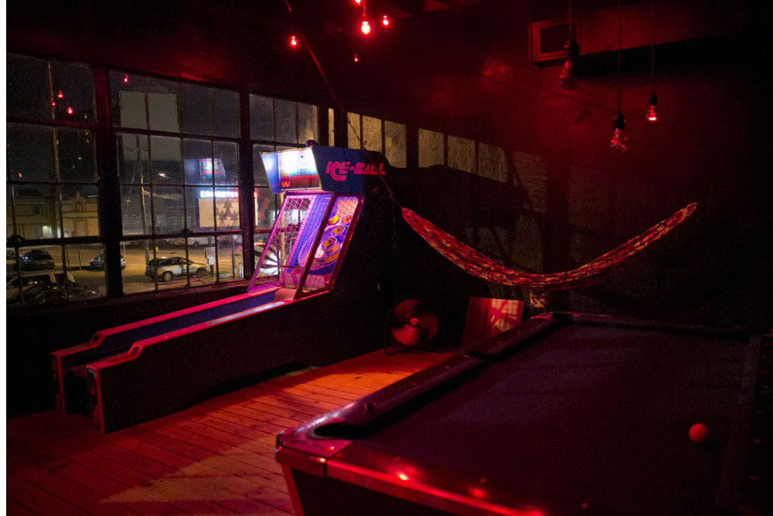
Granby Social Club